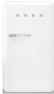
FAB10RWH2 left hand hinge FAB10LWH2