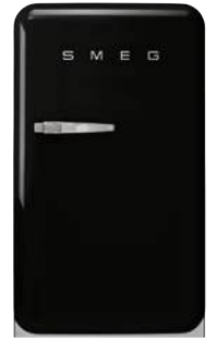
FAB10RBL2 left hand hinge FAB10LBL2