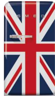
Union Jack FAB10RDUJ2 left hand hinge FAB10LDUJ2