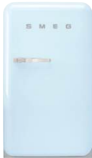
FAB10RPB2 left hand hinge FAB10LPB2