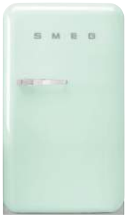
FAB10RPG2 left hand hinge FAB10LPG2