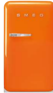
FAB10ROR2 left hand hinge FAB10LOR2