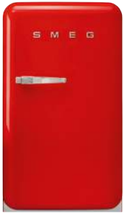
FAB10RRD2 left hand hinge FAB10HLRD2