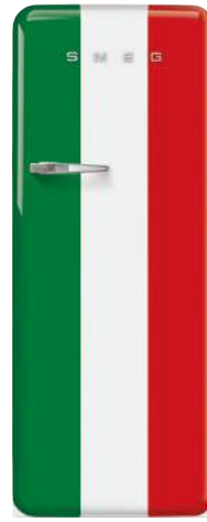
Italian flag FAB28RIT3