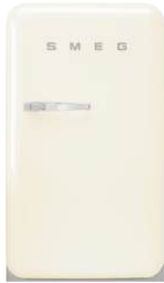
FAB10RCR2 left hand hinge FAB10LCR2