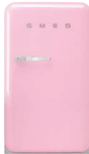
FAB10RPK2 left hand hinge FAB10LPK2