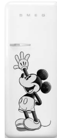
Mickey Mouse FAB28RDMM4