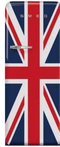
Union Jack FAB28RUJ3